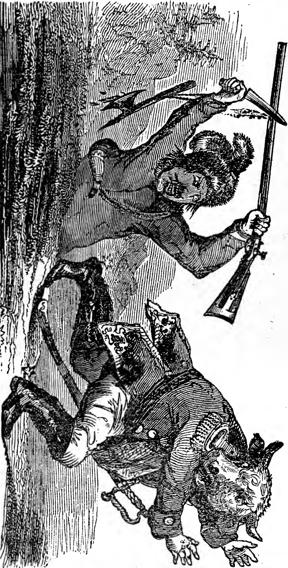
THE GHOST OF CROCKETT SCARING JOHN BULL FROM OREGON.